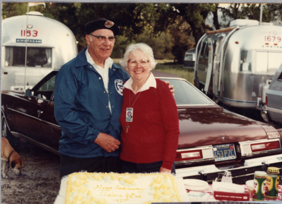
41st Anniversary 14 May 1983