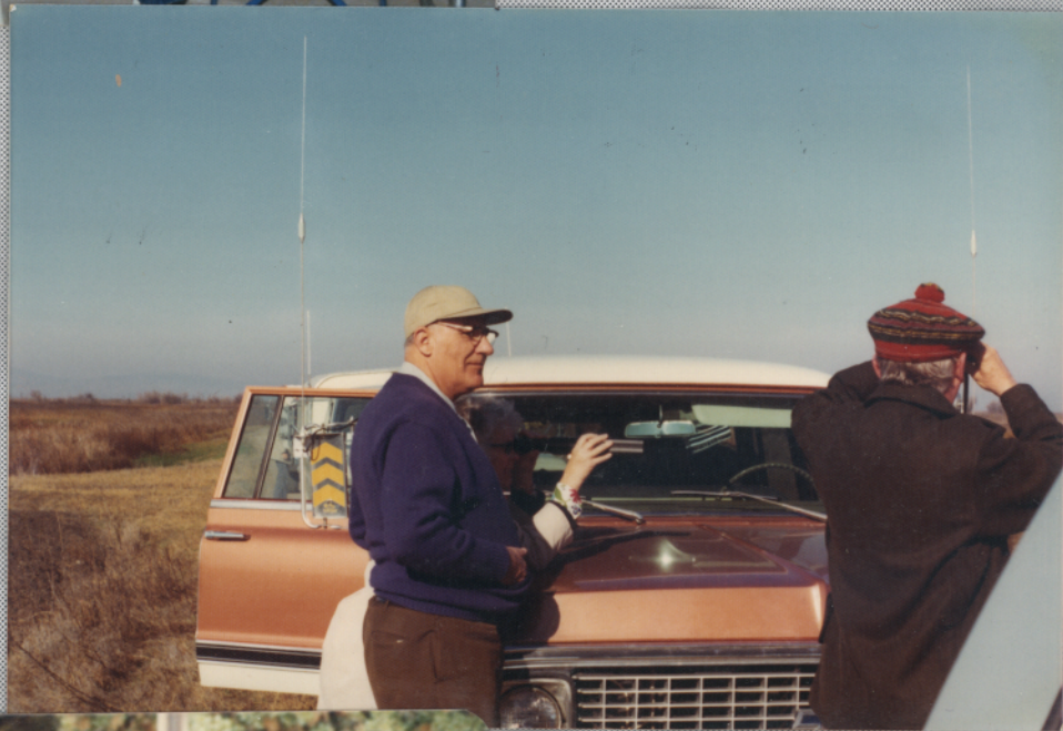
bird watching or watching the bird watchers