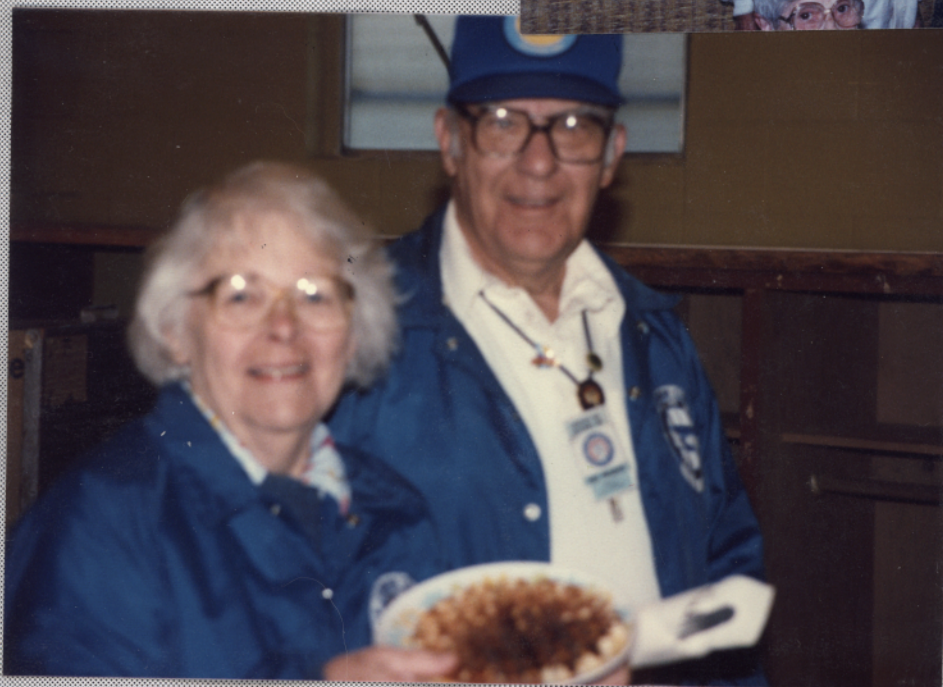
Another May as hosts and another anniversary