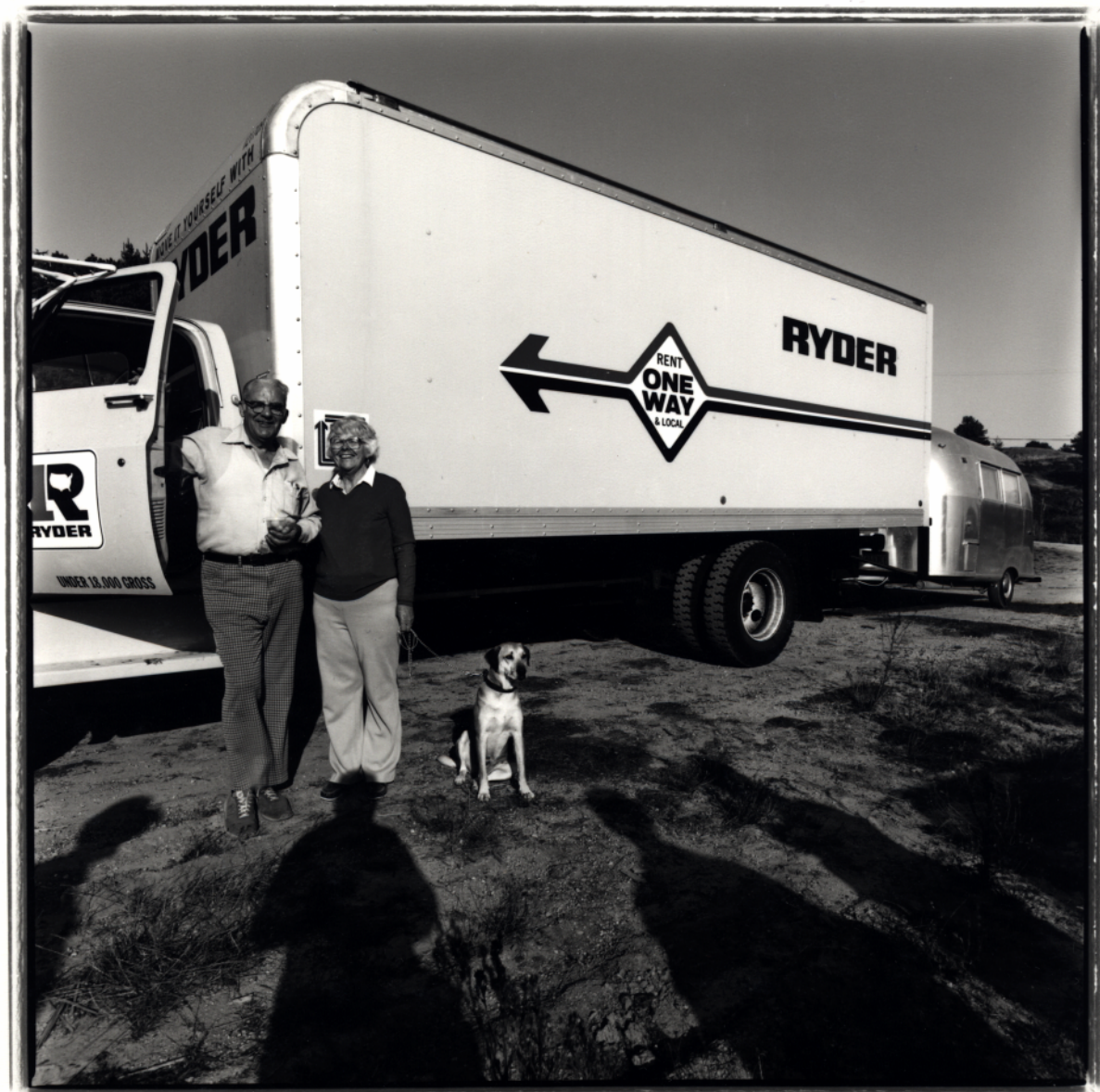
LETPPERS' ARRIVAL AT DAVENPORT